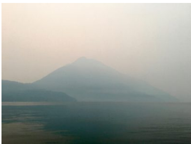
Still so much smoke!

After the concert the kids couldn't resist the rope swing one more time. They jumped off the boat, and each took turns swinging through the air to the water below. I had to pee, so the rope swing was the perfect excuse to get in the water but it was actually a whole lot of fun swinging with the kids.