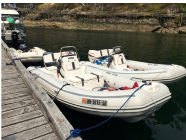
Our dinghies tied up in Refuge Cove