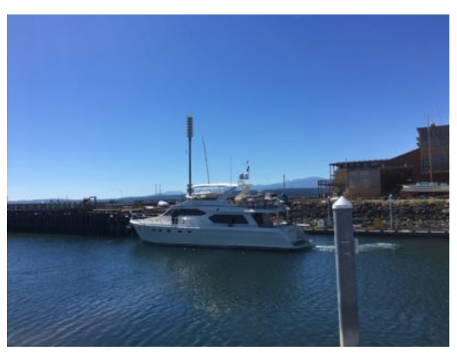
Todd and Tami leaving us on their way home