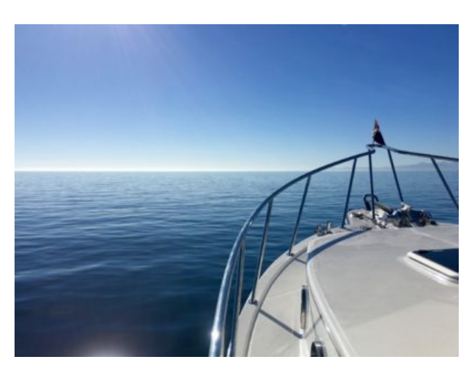
Beautiful open water crossing