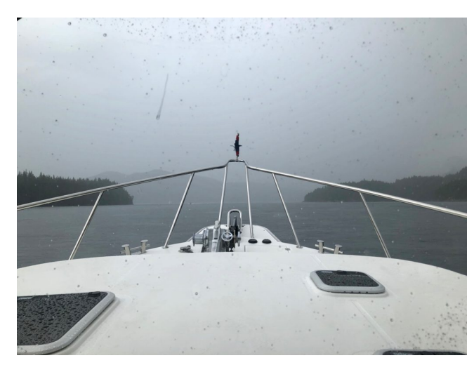
On our way to Blind Channel