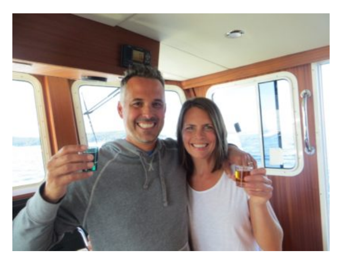
We are off!!