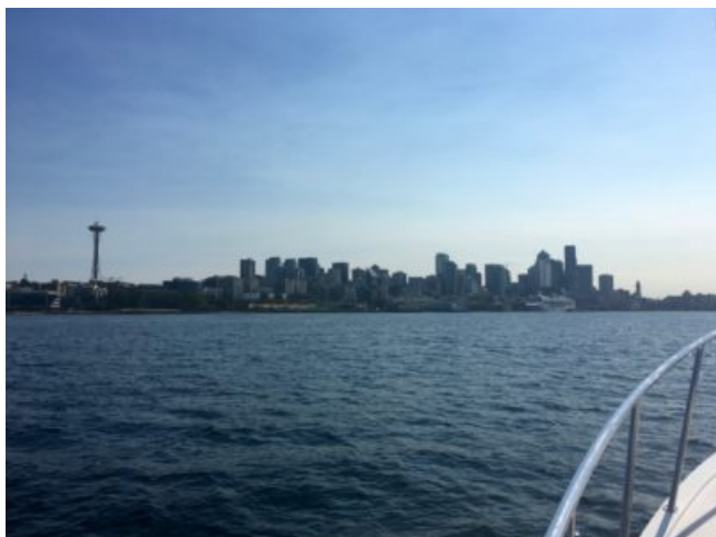
Arriving in Seattle