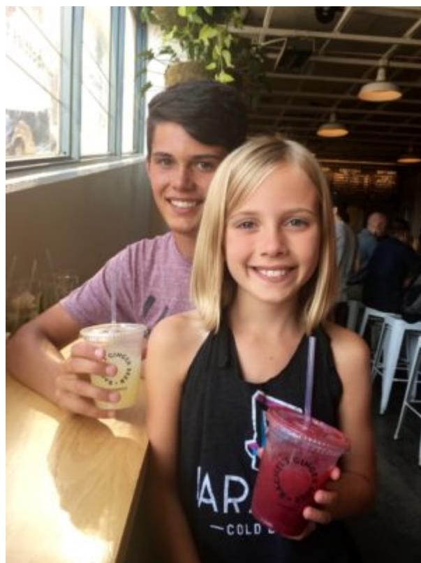
RGB is the best