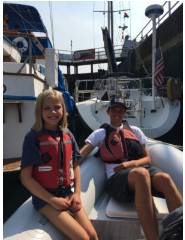
Finally in the locks