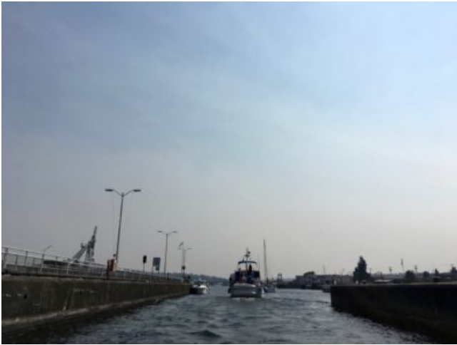
Leaving the locks