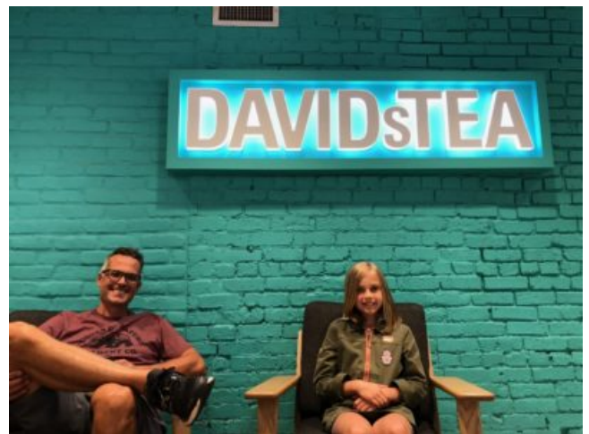
A different tea place, not as fancy