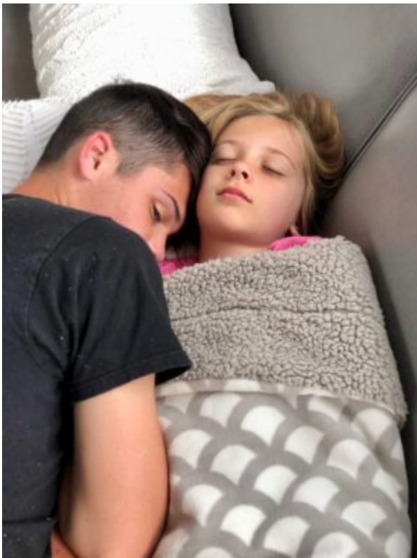
They still snuggle! at least for a while, then they fight.

The next day we grabbed a taxi and headed for the aquarium in Stanley Park. Very busy with kid groups but what an incredible aquarium. A few days ago, we saw a dead sturgeon floating in the water in the Gulf Islands. We had never heard of sturgeon in these waters and figured someone must have caught it in the mouth of some river then chucked it overboard. However, we confirmed at the aquarium that there is indeed White Sturgeon in these here waters. We had lunch in the only restaurant in the park then took a taxi to Gas Town to check out more of the city. After a delicious dinner in Yale Town we prepared for our departure northbound tomorrow.