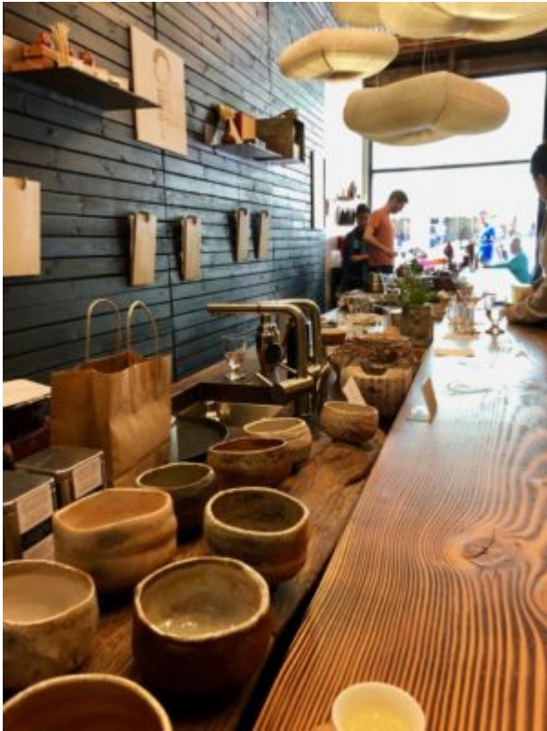
o5 Tea. What a fun expierence