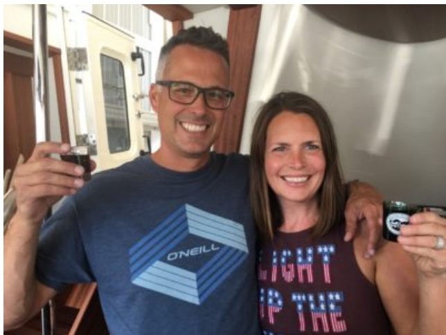
A celebration shot to kick off the cruise

to make it to the northern San Juan Islands. Reluctantly, I agreed to a 5:30am departure that would get us to Stewart Island by 3pm.