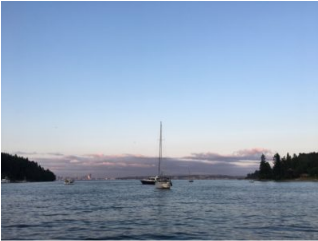
Our view from Blakely Harbor