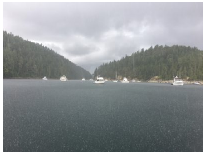
Pouring rain in Prideaux Haven

We had fun hanging out with friends, all 3 boats rafted together, (our boat, our friends Todd & Tami's boat & Todd's parents Bruce & Gloria's boat) and a total of 14 people, we had a huge dinner all together that night.