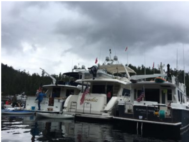
All three boats rafted together