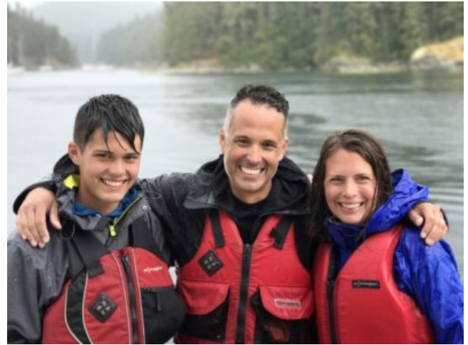
After fishing in the rain for hours