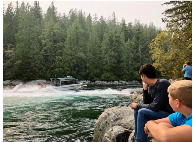
Jet boat tour up small rapids