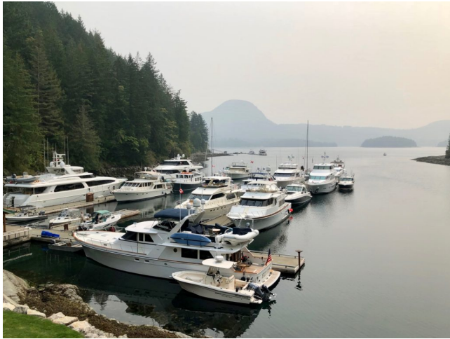
Dent Island Docks