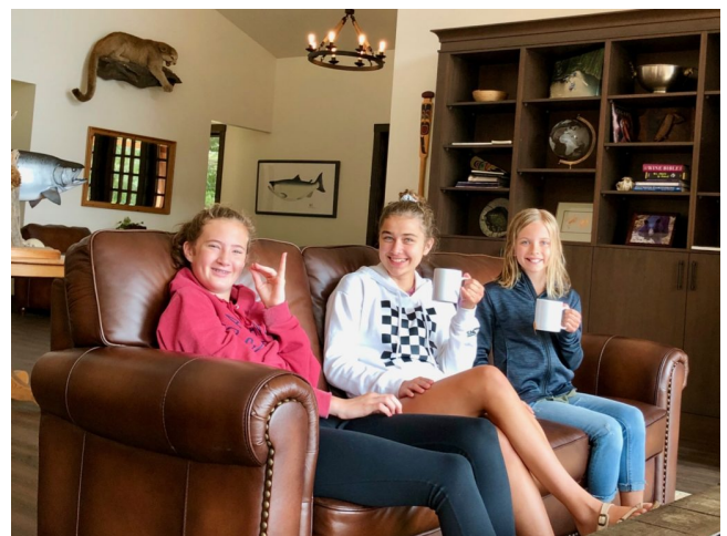
Tea time for the girls