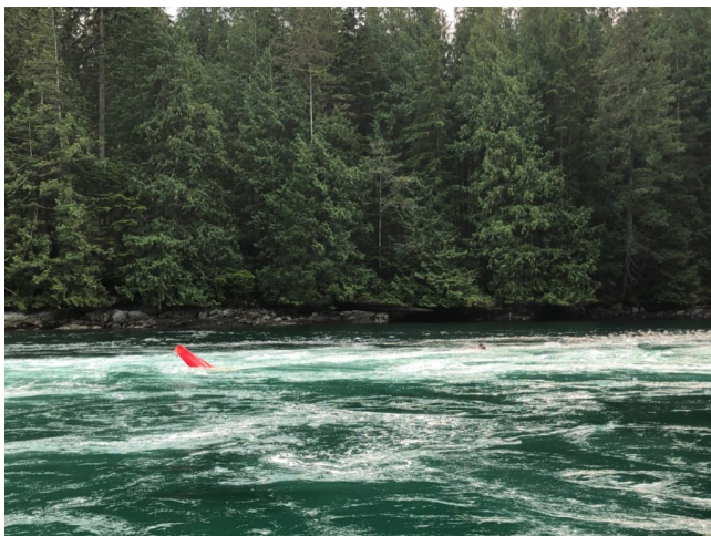
Look closely, half sunk kayak on left, small bobbing head on right