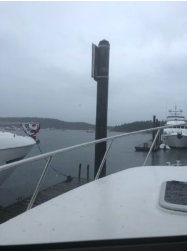
The rain coming down right as we left our slip

unobstructed view of a long, loud and brightly lit show. Super fun and a great way to celebrate Independence Day!