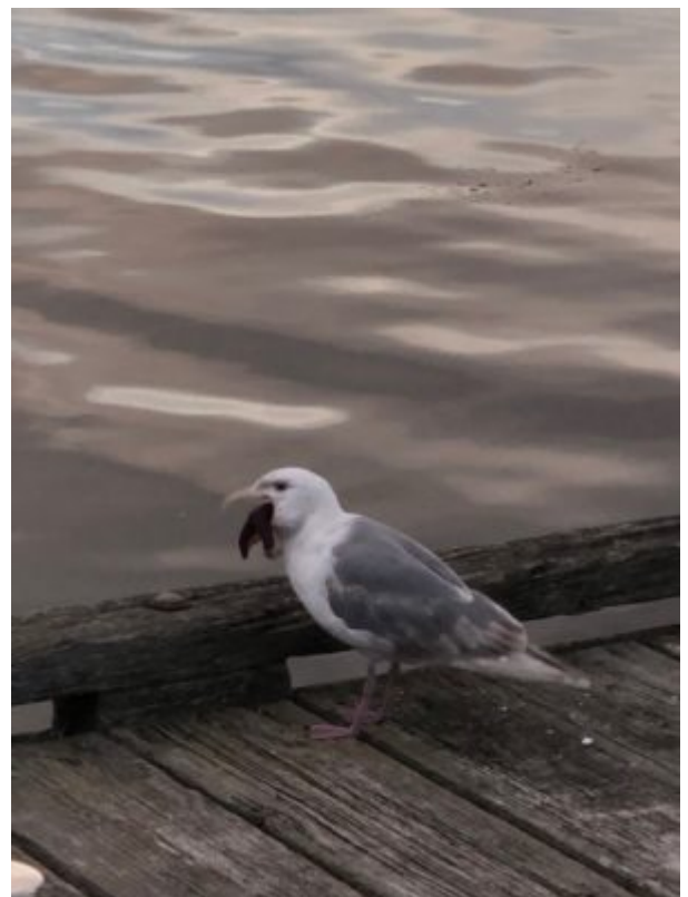
This seagull is having a hard time getting the food