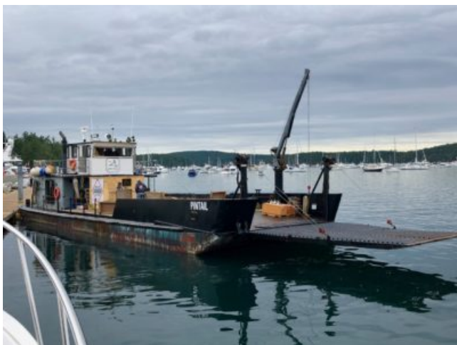
The fireworks boat left the dock right in front of us

We hadn't cleared customs yet and never have in Nanaimo, so we searched for the customs dock which ended up being full of boats. The fuel dock was right next to customs and the nice customs agent at the dock allowed us to clear customs there and fuel up at the same time. Once cleared, we made our way to our assigned slip in the Port Authority Marina. The weather continued to suck (and the 10-day forecast wasn't any better) so we decided to stay 2 nights in Nanaimo.