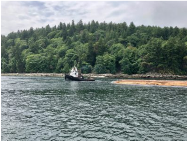
Tug pulling log boom