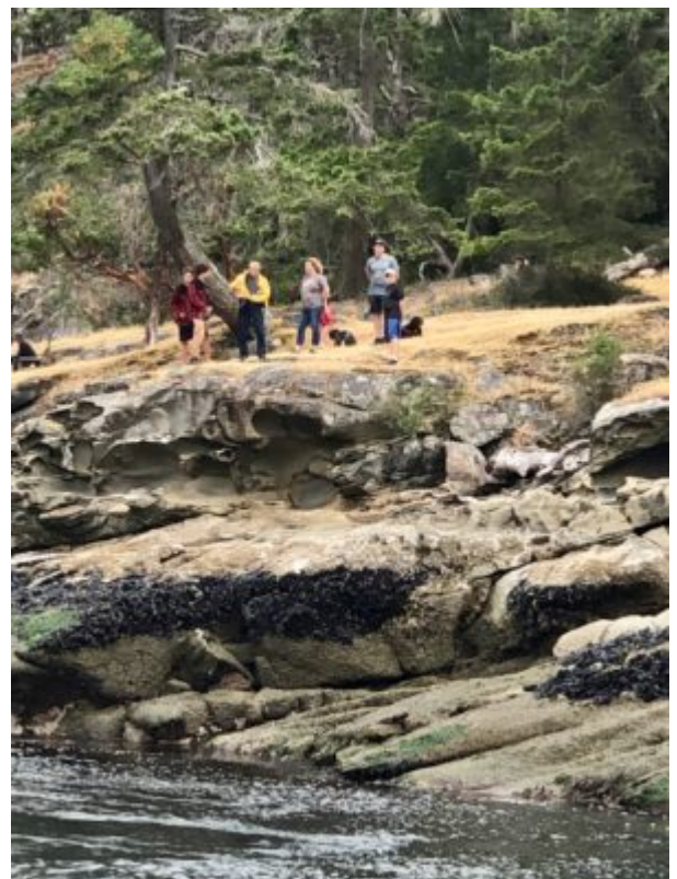
Spectators show up on the shore to watch boats go through