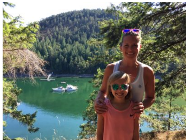
View from our hike