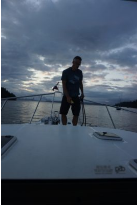
Pulling anchor in the early morning

dinghy out to the south side of Stewart Island for a little fishing and watched an amazing sunset from the water with not another boat in sight.