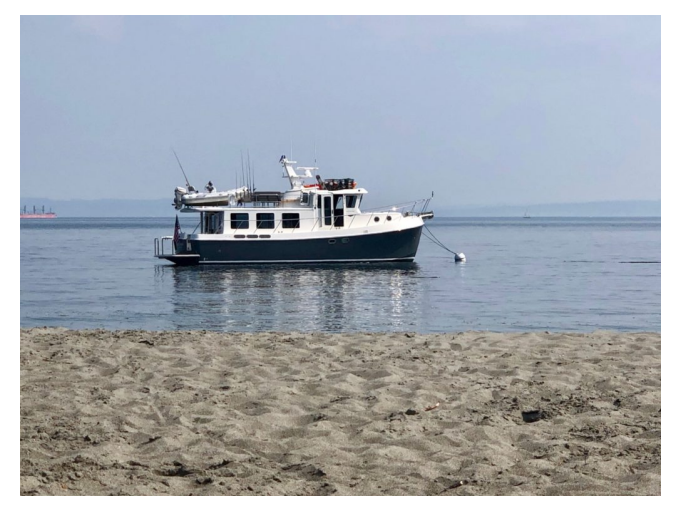
Fort Warden beach

now, but in 1914 when the Smith Tower was built it held that title. We all had a lot of fun exploring the old building that has been beautifully maintained and lunch at the top was fantastic!