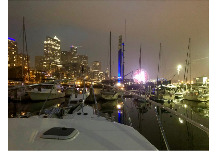
Arriving in Seattle